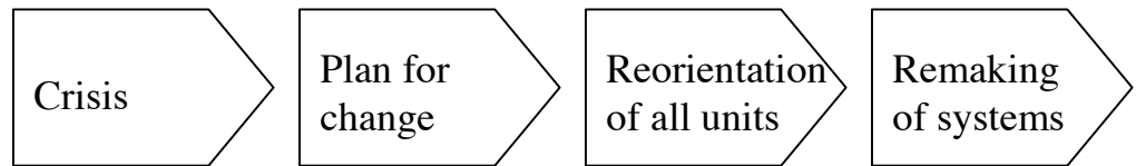
Exhibit 3 The Ambidextrous Form