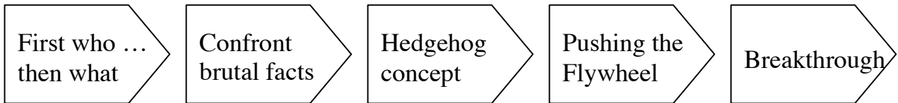
Exhibit 5 Improvisational Transformation